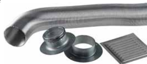
Optional External Air Connection - 80mm

An approved competent person of solid fuel installations should undertake a site survey prior to purchase and must install any VARDE Stove for you. Your VARDE retailer will be able to advise and assist. You may view/download complete installation instructions at our website - www.VARDEstoves.com . These diagrams/dimensions cover some of the basic requirements. All stoves should be installed by a competent person to the requirement of Building Regulations (Document J) and include the fitting of adequate ventilation to ensure safe use. Usually older buildings do not need any additional ventilation for appliances up to 5kW, but modern houses will need additional ventilation in all cases. Some models can be fitted with an optional External Air Kit, or dedicated external air supply, offering a discreet and draught reducing solution to standard room venting.