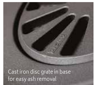
Cast iron disc grate in base for easy ash removal

Please note, the blanking plate for VARDE Shape 2, VD-100473, is available as an optional extra.